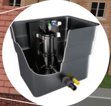
Smart header tank in each dwelling