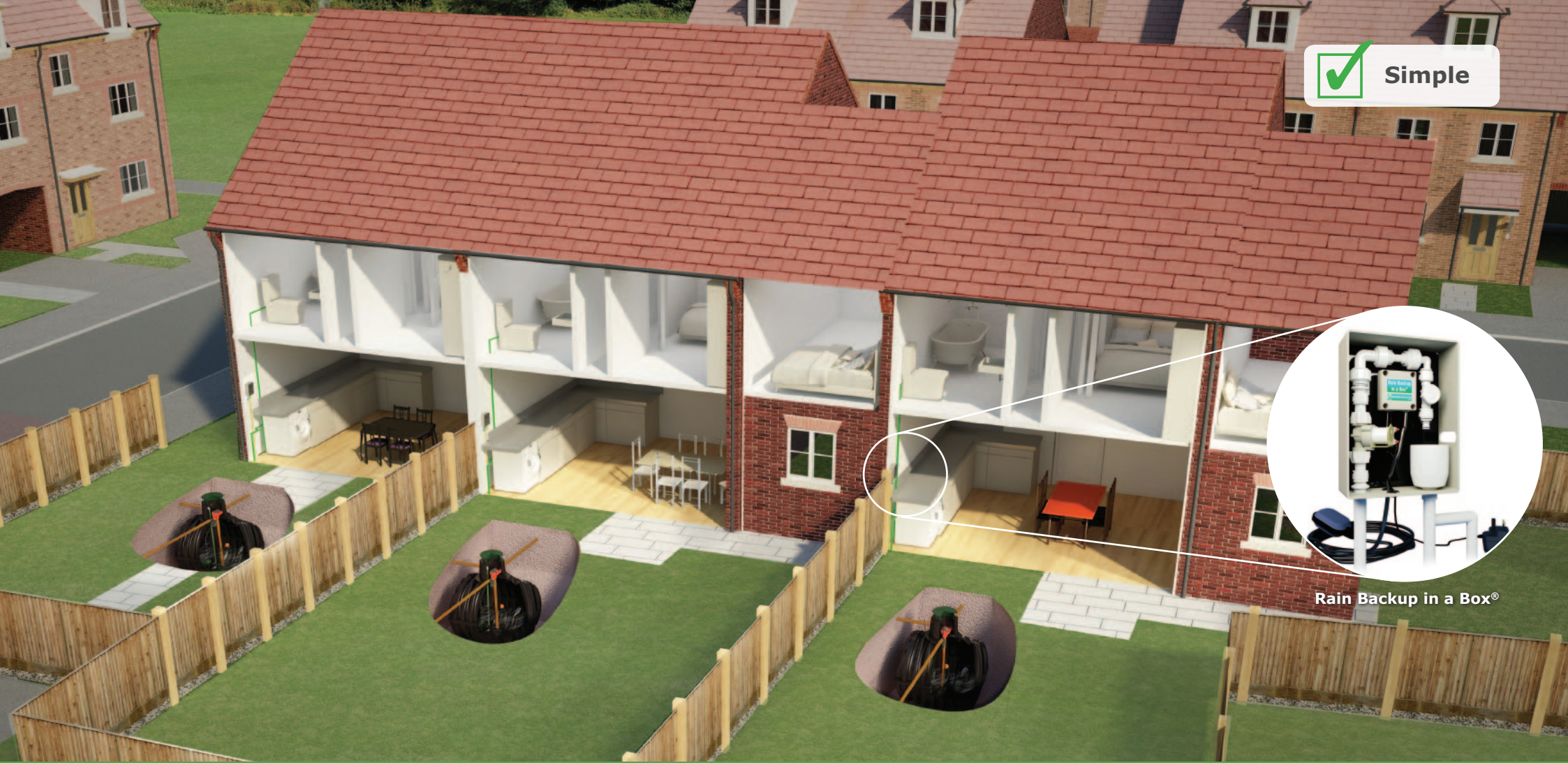
Rain Backup in a Box®