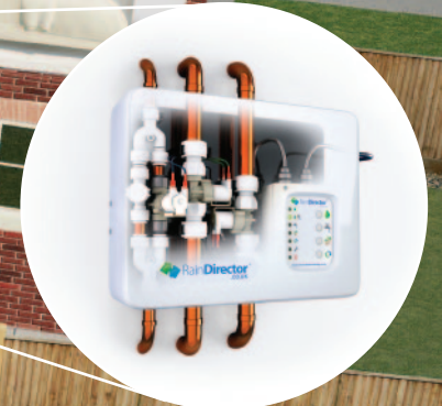
Rain Director® in each dwelling