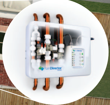
Rain Director® in each dwelling