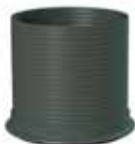
600 mm Spacer ring

Either a 235 or 635mm Entrance Shaft must be used. Vehicle loading lid option also available.