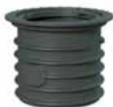
635 mm Entrance Shaft