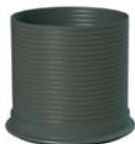
600 mm Spacer Ring

Either a 235 or 635mm Extension Shaft must be used. Vehicle loading lid option also available.